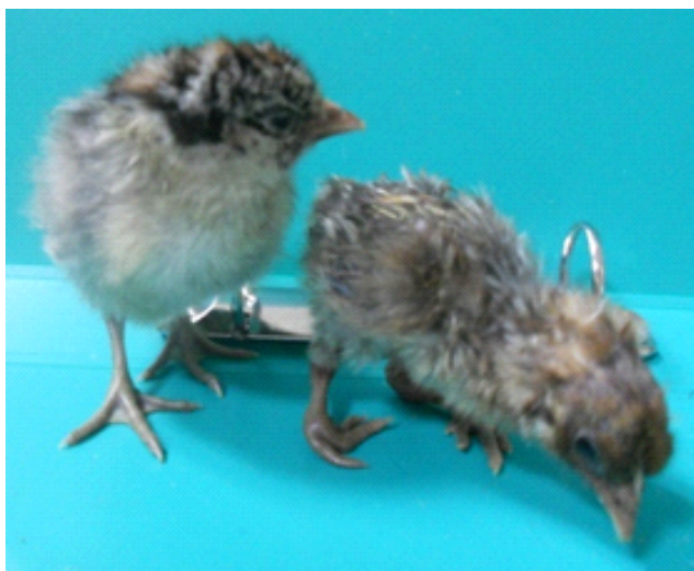
Figure 2: Photograph of chick embryo belonging to experimental group (B2) with inability to stand (arrow) compared with age matched control (A2)