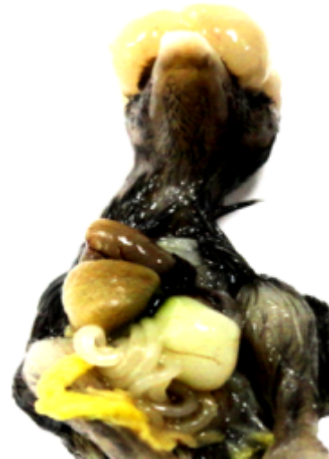
Figure 3: Photograph of newly hatched glucose exposed chick showing exencephaly with anterior body wall defect (B2).